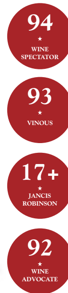
LUIGI BAUDANA BAROLO BAUDANA

“Minerally nose with an undertow of sweet red fruit that becomes more powerful with aeration. Iron, orange skin and ripe raspberry. Youthful, seductive sweet red fruit. Lots of fine, bitter-sweet, chewy tannins that stick to the palate. Long and youthful.”