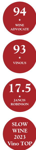
LUIGI BAUDANA BAROLO CERRETTA

“The 2018 Barolo Cerretta is a potent, searing wine, its mid-weight structure notwithstanding. Scorching tannins wrap around a core of dark red/black fruit, gravel, smoke, crushed rocks, menthol, licorice and game.”