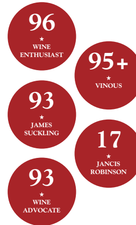
LUIGI BAUDANA BAROLO BAUDANA

“Youthful mid ruby. Perfumed and inviting with earthy hints and concentrated fruit. Generous mouthful of cherry, which at the same time is very contained and with a good dose of acidity. Very fine, persistent tannins underneath clinging to the fruit. Finely balanced and nervy at the same time.”