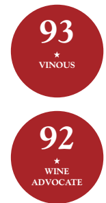
LUIGI BAUDANA BAROLO SERRALUNGA

“The 2017 Barolo del Comune di Serralunga d’Alba may very well turn out to be one of the best wines of the year in its peer group. Dark and wonderfully expressive, yet also light on its feet for a Serralunga Barolo, the 2017 has so much going on. Black cherry, plum, spice, gravel, cured meats, lavender and sage all meld together in this dark yet translucent Barolo.”