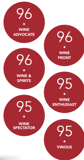
LUIGI BAUDANA BAROLO CERRETTA

“There is generous black fruit in there as well, carefully woven into the greater texture of the wine. The tannins are accessible and integrated, and that’s an important fact to know when measuring the wine’s drinking window. You could age it longer or even contemplate a cork-popping in the not-so-distant future”