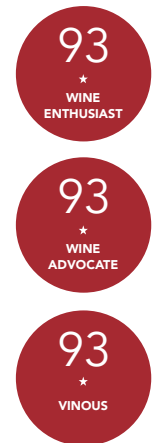
LUIGI BAUDANA BAROLO SERRALUNGA

“Fragrant aromas of blueflower, forest-berry menthol form the enticing nose. Smooth, taut and delicious, the focused palate delivers juicy Marasca cherry, spiced cranberry and star anise alongside firm, polished tannins and bright acidity.”