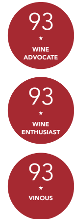
LUIGI BAUDANA BAROLO SERRALUNGA

“Fragrant aromas of blueflower, forest-berry menthol form the enticing nose. Smooth, taut and delicious, the focused palate delivers juicy Marasca cherry, spiced cranberry and star anise alongside firm, polished tannins and bright acidity.”