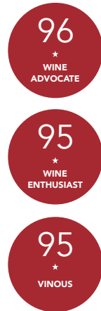
LUIGI BAUDANA BAROLO CERRETTA

“There is generous black fruit in there as well, carefully woven into the greater texture of the wine. The tannins are accessible and integrated, and that’s an important fact to know when measuring the wine’s drinking window. You could age it longer or even contemplate a cork-popping in the not-so-distant future”